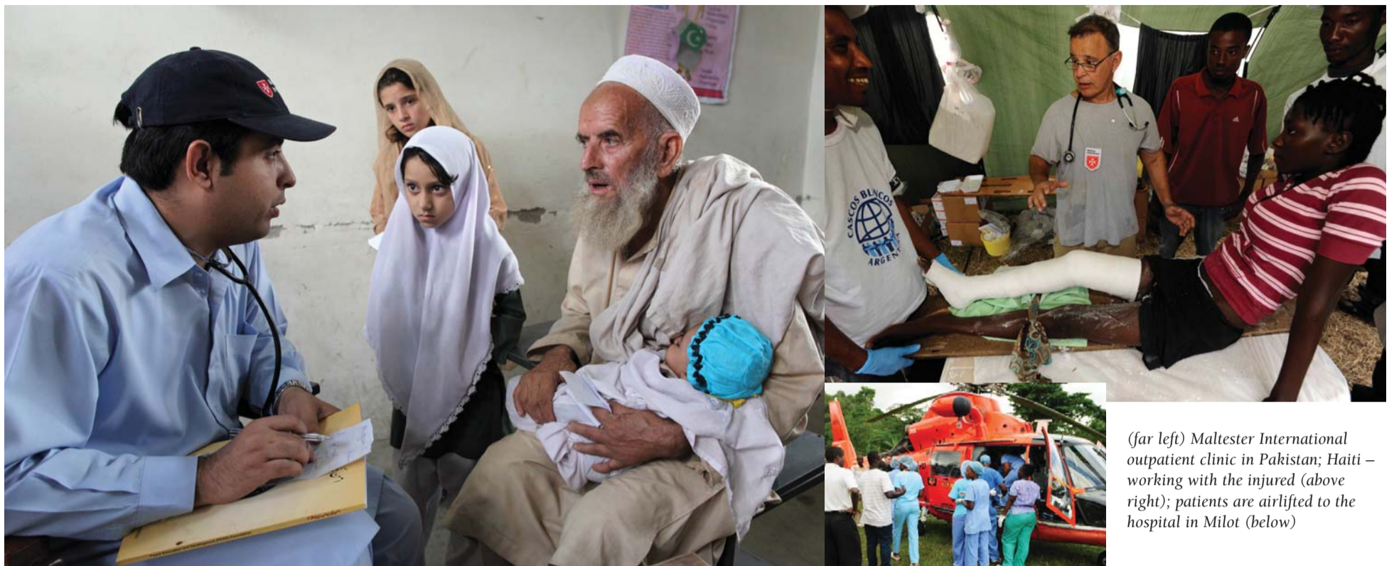
(far left) Malteser International outpatient clinic in Pakistan; Haiti – working with the injured (above right); patients are airlifted to the hospital in Milot (below)