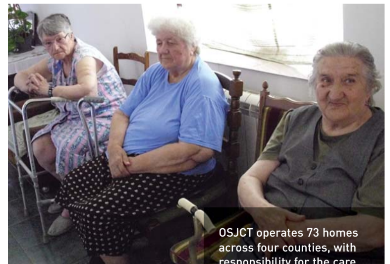
OSJCT operates 73 homes across four counties, with responsibility for the care of 3,300 residents and employing c. 3,500 staff. For more information, see the Trust's website: www.osjct.co.uk