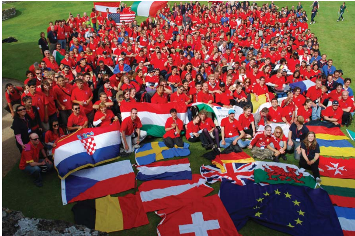
The happy Summer Camp for Young Disabled gather at Pembroke Castle, Wales