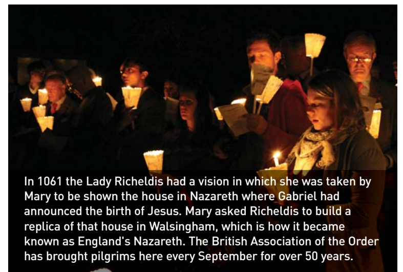
In 1061 the Lady Richeldis had a vision in which she was taken by Mary to be shown the house in Nazareth where Gabriel had announced the birth of Jesus. Mary asked Richeldis to build a replica of that house in Walsingham, which is how it became known as England's Nazareth. The British Association of the Order has brought pilgrims here every September for over 50 years.